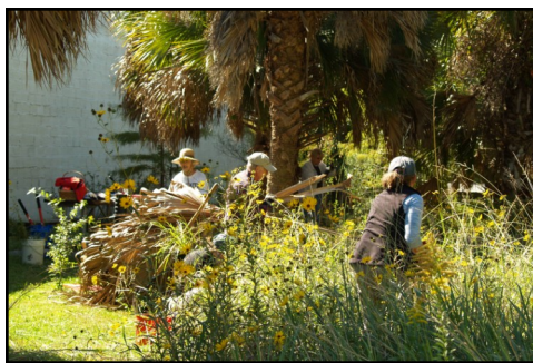
At left: Members of the local Sweetbay Chapter of the Florida Native Plant Society helped weed the wildflower gardens at the Palm Preserve.